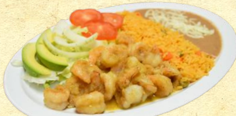
Camarones al Mojo de Ajo

Shrimp cooked with our special garlic sauce, served with lettuce, tomatoes, onions, avocado, rice and refried beans - $16.99