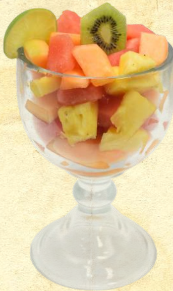
FRUIT COCKTAIL - $5.99