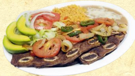
Costillas a la Mexicana

Grilled beef ribs cooked with tomatoes, jalapeños and onions, served with lettuce, tomatoes, onions, avocado, rice and refried beans - $19.99