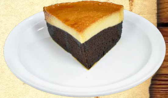
CHOCOFLAN - $4.49