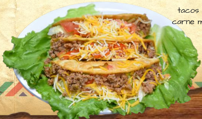
tacos de carne molida

Three ground beef tacos with lettuce, chopped tomato, sour cream and grated monterrey cheese served on a bed of romaine lettuce - $7.49