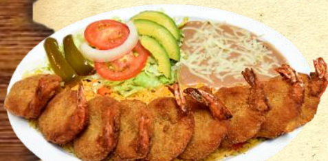
Camarones de la Casa

Breaded shrimp, served with lettuce, tomatoes, onions, avocado, rice, and refried beans - $16.99