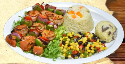
Brochetas de la Casa

Skewered shrimp on a bed of romaine lettuce, served with mashed potatoes, white rice, black bean and corn salad. Served with corn or flour tortillas - $17.99