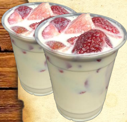
STRAWBERRIES AND CREAM - $4.49