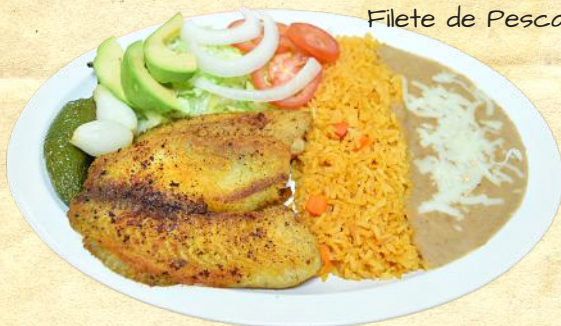
Filete de Pescado