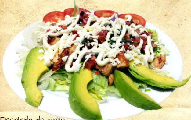
Ensalada de pollo

Chicken fajitas cooked with tomatoes, onions, and jalapeños, served with lettuce, tomatoes, onions, avocado, rice and refried beans - $14.99