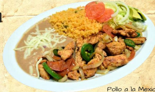
Pollo a la Mexicana