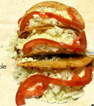
Tacos de papa