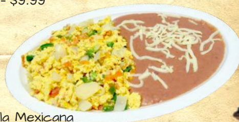
Huevos a la Mexicana

Dos huevos estrellados servidos sobre una tortilla bañados de salsa roja y verde - $9.99