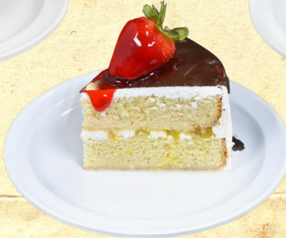
SLICE OF 3 LECHE CAKE - $4.49