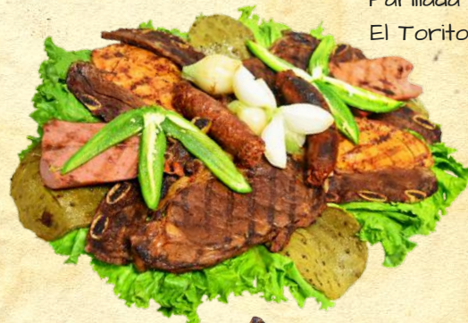
Parillada El Torito

Chopped grilled chicken breast, slices of tomato, onion and avocado, served on a bed of lettuce. Topped with sour cream, pico de gallo and queso fresco - $9.99