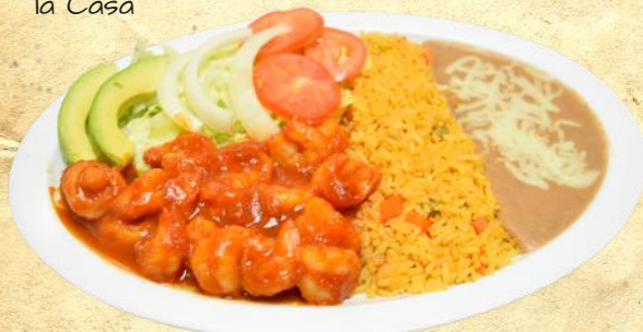
Camarones a la Diabla