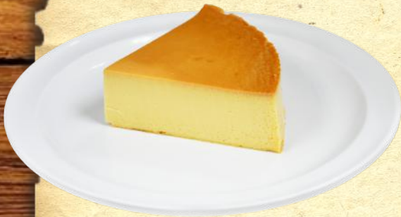
FLAN - $4.49