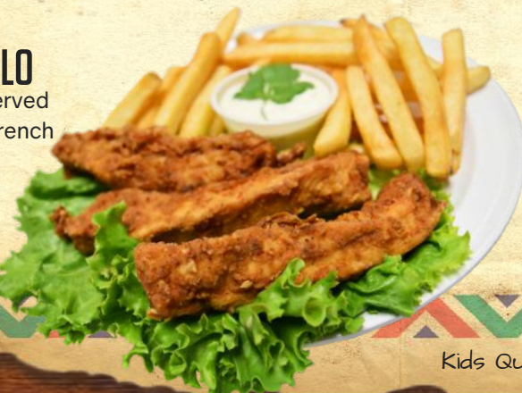
Tiritas de Pollo

3 Chicken fingers served with vegetables or french fries - $8.49