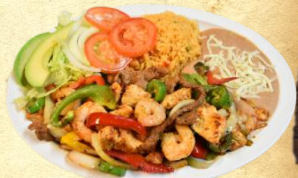
Plato con Camarones

Sautéed steak, chicken and shrimp with tomatoes, bell pepper, onions and jalapeños, served with lettuce, tomatoes, onions, avocado, rice and refried beans - $16.99